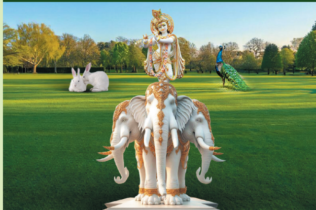
Brundhavanam Theme Park