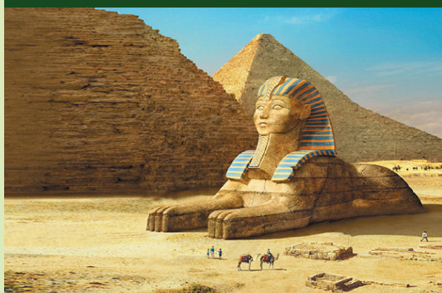
Egypt Theme Park