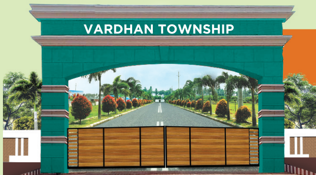
Grand Entrance Arch